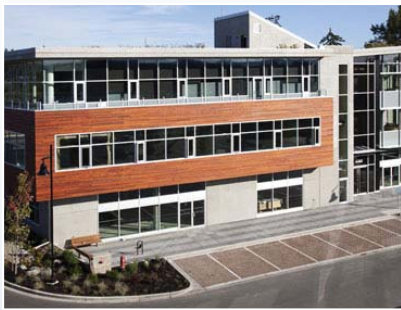
140-4392 West Saanich Road